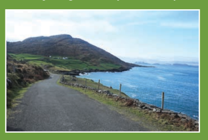
From the above view I teased out the parts I liked the most and created the oil painting below

Spend a day exploring the Beara Peninsula with me, and let me introduce you to new ideas for your work I get a great deal of inspiration for my art work from living here on the Beara Peninsula and believe you might too Tell me what you like to paint, draw or photograph, and then I will put together a day tailored to your wishes.